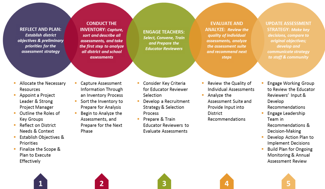
FIGURE 1 | Assessment Strategy Process in Five Phases

We recommend approaching this work in five phases. Though these are outlined sequentially, in reality the process will not be purely linear and district staff will need to view the phases as more iterative and look ahead to future phases while doing the core work of an individual phase. At the highest level, below is a snapshot of the phases.